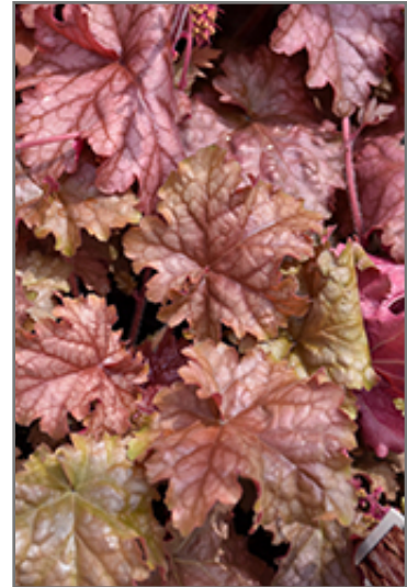
Carnival Peach Parfait Coral Bells foliage