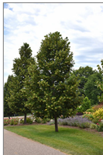
Boulevard Linden