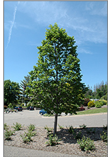
Boulevard Linden

This tree should only be grown in full sunlight. It is very adaptable to both dry and moist locations, and should do just fine under average home landscape conditions. It is not particular as to soil type or pH. It is highly tolerant of urban pollution and will even thrive in inner city environments. This is a selection of a native North American species.