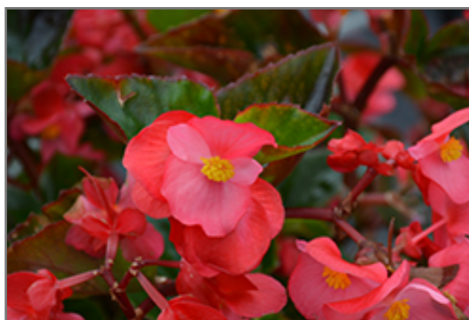
Big Rose Green Leaf Begonia flowers

Big Rose Green Leaf Begonia is recommended for the following landscape applications;