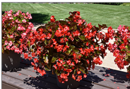
Whopper Red Bronze Leaf Begonia flowers