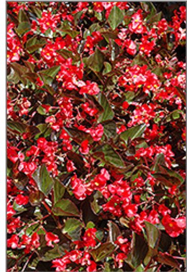
Whopper Red Bronze Leaf Begonia flowers

Whopper Red Bronze Leaf Begonia is a fine choice for the garden, but it is also a good selection for planting in outdoor containers and hanging baskets. It can be used either as 'filler' or as a 'thriller' in the 'spiller-thriller-filler' container combination, depending on the height and form of the other plants used in the container planting. It is even sizeable enough that it can be grown alone in a suitable container. Note that when growing plants in outdoor containers and baskets, they may require more frequent waterings than they would in the yard or garden.