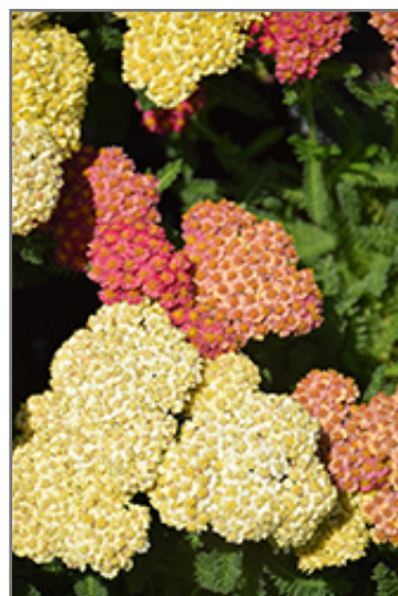
Desert Eve Terracotta Yarrow flowers

Desert Eve Terracotta Yarrow is recommended for the following landscape applications;