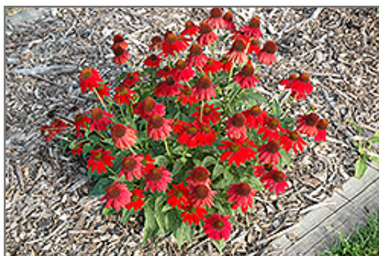
Sombrero Salsa Red Coneflower in bloom

Sombrero Salsa Red Coneflower will grow to be about 16 inches tall at maturity extending to 24 inches tall with the flowers, with a spread of 24 inches. Its foliage tends to remain dense right to the ground, not requiring facer plants in front. It grows at a medium rate, and under ideal conditions can be expected to live for approximately 10 years. As an herbaceous perennial, this plant will usually die back to the crown each winter, and will regrow from the base each spring. Be careful not to disturb the crown in late winter when it may not be readily seen!