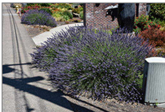
Phenomenal Lavender in bloom

Phenomenal Lavender is recommended for the following landscape applications;