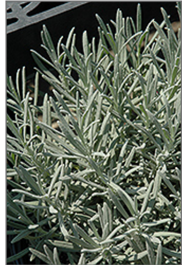
Phenomenal Lavender foliage

Phenomenal Lavender makes a fine choice for the outdoor landscape, but it is also well-suited for use in outdoor pots and containers. Because of its height, it is often used as a 'thriller' in the 'spiller-thriller-filler' container combination; plant it near the center of the pot, surrounded by smaller plants and those that spill over the edges. It is even sizeable enough that it can be grown alone in a suitable container. Note that when grown in a container, it may not perform exactly as indicated on the tag - this is to be expected. Also note that when growing plants in outdoor containers and baskets, they may require more frequent waterings than they would in the yard or garden. Be aware that in our climate, most plants cannot be expected to survive the winter if left in containers outdoors, and this plant is no exception. Contact our experts for more information on how to protect it over the winter months.