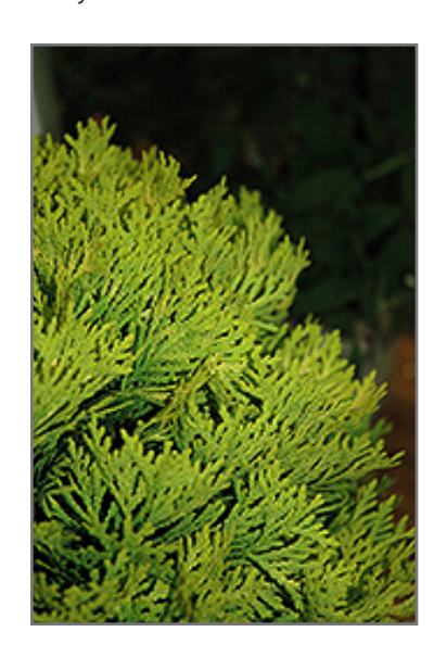
Anna's Magic Ball Arborvitae foliage

Anna's Magic Ball Arborvitae is recommended for the following landscape applications;