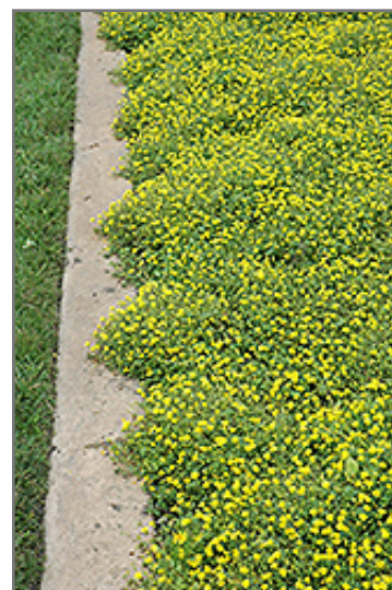
Magic Carpet Yellow Mecardonia in bloom