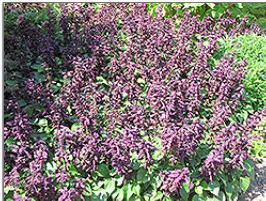
Vista Purple Sage in bloom