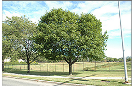
Norway Maple

Norway Maple will grow to be about 50 feet tall at maturity, with a spread of 40 feet. It has a high canopy with a typical clearance of 7 feet from the ground, and should not be planted underneath power lines. As it matures, the lower branches of this tree can be strategically removed to create a high enough canopy to support unobstructed human traffic underneath. It grows at a medium rate, and under ideal conditions can be expected to live to a ripe old age of 100 years or more; think of this as a heritage tree for future generations!