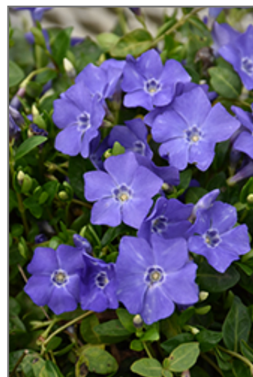
Bowles Periwinkle flowers

Bowles Periwinkle is recommended for the following landscape applications;