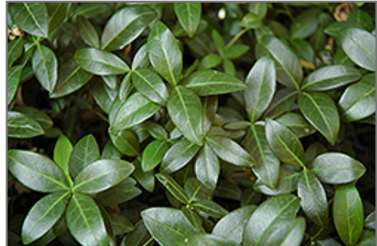
Bowles Periwinkle foliage

Bowles Periwinkle will grow to be only 4 inches tall at maturity extending to 6 inches tall with the flowers, with a spread of 18 inches. Its foliage tends to remain low and dense right to the ground. It grows at a fast rate, and under ideal conditions can be expected to live for approximately 10 years. As an evergreen perennial, this plant will typically keep its form and foliage year-round.