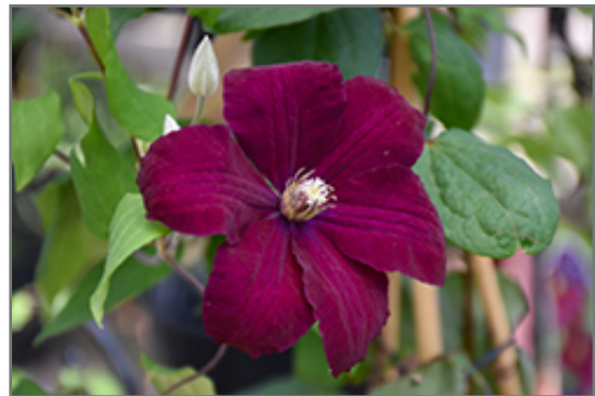
Rouge Cardinal Clematis flowers