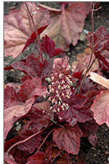
Lava Lamp Coral Bells flowers