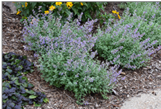
Purrsian Blue Catmint in bloom