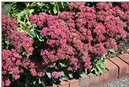
Carl Stonecrop in bloom

Carl Stonecrop is recommended for the following landscape applications;