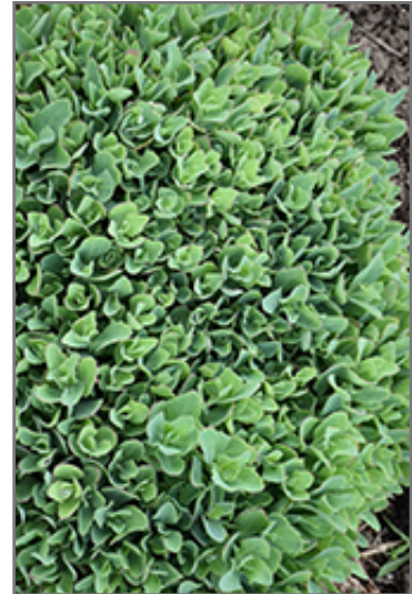
Carl Stonecrop foliage

Carl Stonecrop will grow to be about 16 inches tall at maturity, with a spread of 24 inches. When grown in masses or used as a bedding plant, individual plants should be spaced approximately 18 inches apart. Its foliage tends to remain dense right to the ground, not requiring facer plants in front. It grows at a fast rate, and under ideal conditions can be expected to live for approximately 15 years. As an herbaceous perennial, this plant will usually die back to the crown each winter, and will regrow from the base each spring. Be careful not to disturb the crown in late winter when it may not be readily seen!