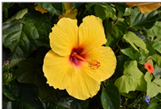
Sunny Wind Hibiscus flowers

This plant does best in full sun to partial shade. It requires an evenly moist well-drained soil for optimal growth, but will die in standing water. It is not particular as to soil type or pH. It is highly tolerant of urban pollution and will even thrive in inner city environments. Consider applying a thick mulch around the root zone in winter to protect it in exposed locations or colder microclimates. This is a selected variety of a species not originally from North America. It can be propagated by cuttings; however, as a cultivated variety, be aware that it may be subject to certain restrictions or prohibitions on propagation.