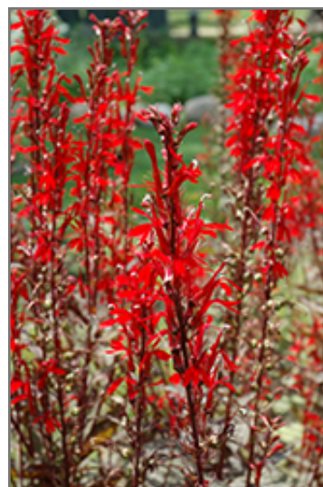
Black Truffle Cardinal Flower flowers