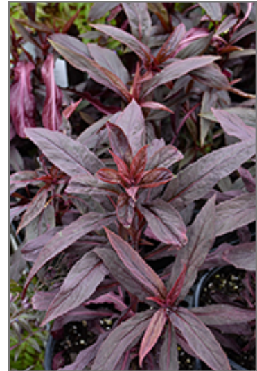
Black Truffle Cardinal Flower foliage

Black Truffle Cardinal Flower is a fine choice for the garden, but it is also a good selection for planting in outdoor pots and containers. With its upright habit of growth, it is best suited for use as a 'thriller' in the 'spiller-thriller-filler' container combination; plant it near the center of the pot, surrounded by smaller plants and those that spill over the edges. It is even sizeable enough that it can be grown alone in a suitable container. Note that when growing plants in outdoor containers and baskets, they may require more frequent waterings than they would in the yard or garden. Be aware that in our climate, most plants cannot be expected to survive the winter if left in containers outdoors, and this plant is no exception. Contact our experts for more information on how to protect it over the winter months.