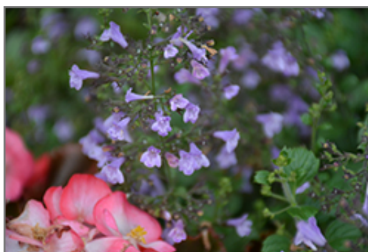
Marvelette Blue Dwarf Calamint flowers