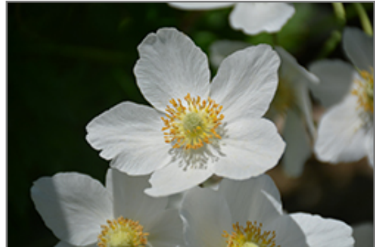
Windflower flowers

Windflower is recommended for the following landscape applications;