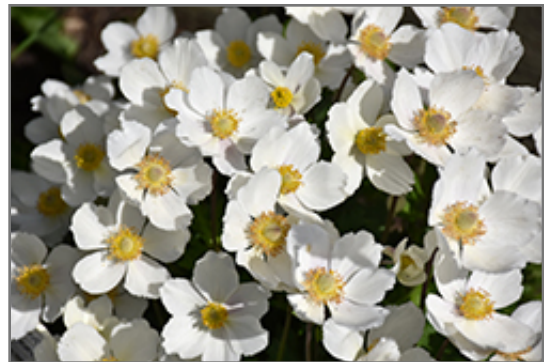
Windflower flowers