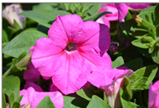
Easy Wave Pink Passion Petunia flowers

Easy Wave Pink Passion Petunia is recommended for the following landscape applications;