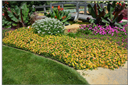
Supertunia Honey Petunia in bloom

Supertunia Honey Petunia is a fine choice for the garden, but it is also a good selection for planting in outdoor containers and hanging baskets. Because of its trailing habit of growth, it is ideally suited for use as a 'spiller' in the 'spiller-thriller-filler' container combination; plant it near the edges where it can spill gracefully over the pot. Note that when growing plants in outdoor containers and baskets, they may require more frequent waterings than they would in the yard or garden.