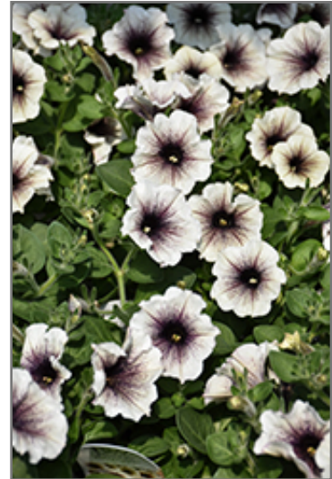
Supertunia Latte Petunia flowers