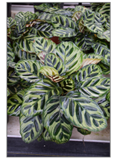
Peacock Plant in full

There are many factors that will affect the ultimate height, spread and overall performance of a plant when grown indoors; among them, the size of the pot it's growing in, the amount of light it receives, watering frequency, the pruning regimen and repotting schedule. Use the information described here as a guideline only; individual performance can and will vary. Please contact the store to speak with one of our experts if you are interested in further details concerning recommendations on pot size, watering, pruning, repotting, etc.