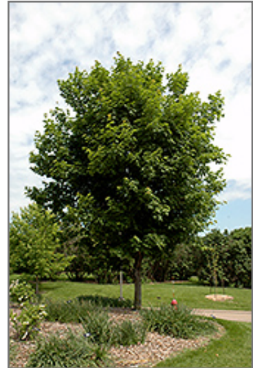
Sugar Maple

* This is a 'special order' plant - contact store for details