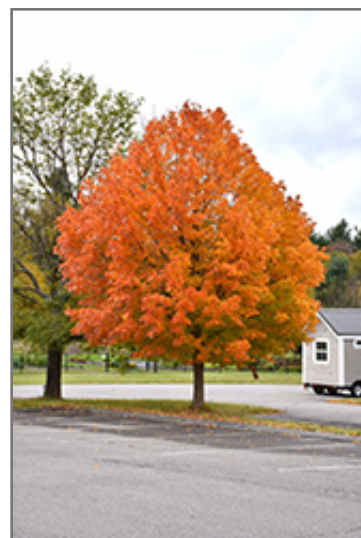
Sugar Maple in fall

Sugar Maple will grow to be about 60 feet tall at maturity, with a spread of 50 feet. It has a high canopy of foliage that sits well above the ground, and should not be planted underneath power lines. As it matures, the lower branches of this tree can be strategically removed to create a high enough canopy to support unobstructed human traffic underneath. It grows at a slow rate, and under ideal conditions can be expected to live to a ripe old age of 100 years or more; think of this as a heritage tree for future generations!