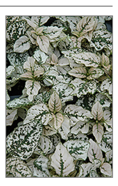
Splash Select White Polka Dot Plant foliage

There are many factors that will affect the ultimate height, spread and overall performance of a plant when grown indoors; among them, the size of the pot it's growing in, the amount of light it receives, watering frequency, the pruning regimen and repotting schedule. Use the information described here as a guideline only; individual performance can and will vary. Please contact the store to speak with one of our experts if you are interested in further details concerning recommendations on pot size, watering, pruning, repotting, etc.