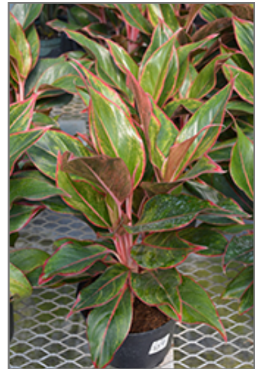
Siam Aurora Chinese Evergreen in full