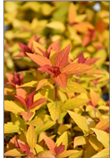
Double Play Candy Corn Spirea foliage