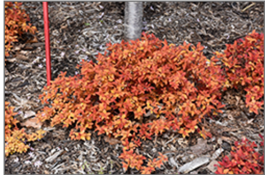
Double Play Candy Corn Spirea

This shrub should only be grown in full sunlight. It prefers to grow in average to moist conditions, and shouldn't be allowed to dry out. It is not particular as to soil type or pH. It is highly tolerant of urban pollution and will even thrive in inner city environments. This is a selected variety of a species not originally from North America.