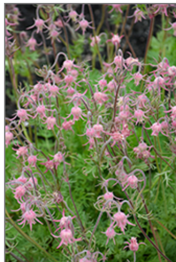
Prairie Smoke flowers

Prairie Smoke is recommended for the following landscape applications;