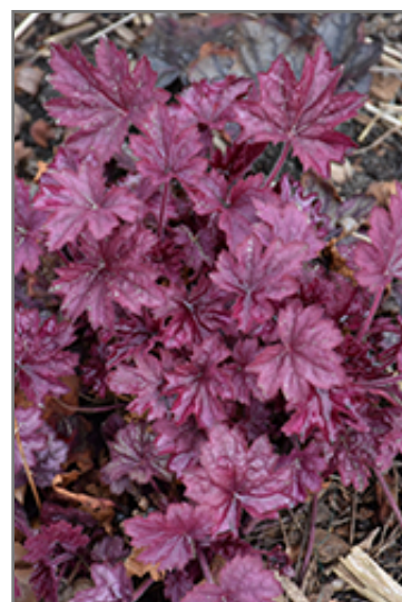
Wild Rose Coral Bells foliage