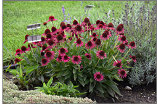
Delicious Candy Coneflower in bloom

Delicious Candy Coneflower will grow to be about 18 inches tall at maturity extending to 24 inches tall with the flowers, with a spread of 15 inches. It grows at a medium rate, and under ideal conditions can be expected to live for approximately 10 years. As an herbaceous perennial, this plant will usually die back to the crown each winter, and will regrow from the base each spring. Be careful not to disturb the crown in late winter when it may not be readily seen!