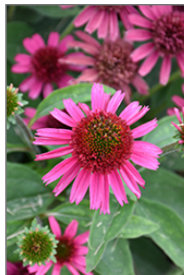
Delicious Candy Coneflower flowers

Delicious Candy Coneflower is recommended for the following landscape applications;