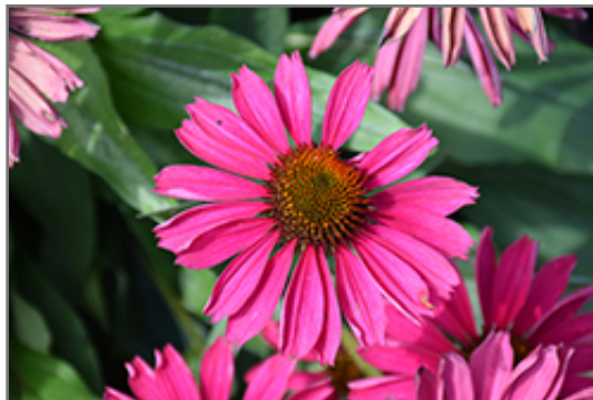
Kismet Raspberry Coneflower flowers