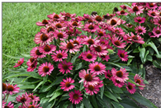
Kismet Raspberry Coneflower in bloom

Kismet Raspberry Coneflower will grow to be about 16 inches tall at maturity, with a spread of 24 inches. Its foliage tends to remain dense right to the ground, not requiring facer plants in front. It grows at a fast rate, and under ideal conditions can be expected to live for approximately 10 years. As an herbaceous perennial, this plant will usually die back to the crown each winter, and will regrow from the base each spring. Be careful not to disturb the crown in late winter when it may not be readily seen!