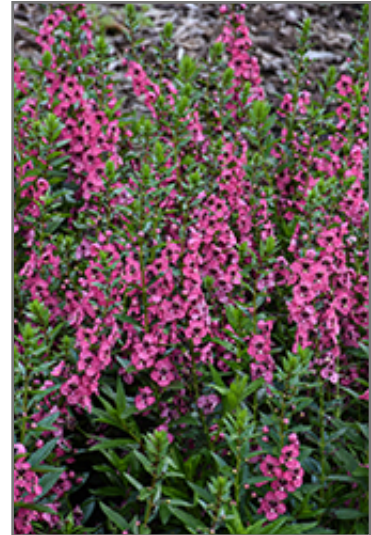
Angelface Perfectly Pink Angelonia flowers

Angelface Perfectly Pink Angelonia is a fine choice for the garden, but it is also a good selection for planting in outdoor containers and hanging baskets. With its upright habit of growth, it is best suited for use as a 'thriller' in the 'spiller-thriller-filler' container combination; plant it near the center of the pot, surrounded by smaller plants and those that spill over the edges. Note that when growing plants in outdoor containers and baskets, they may require more frequent waterings than they would in the yard or garden.