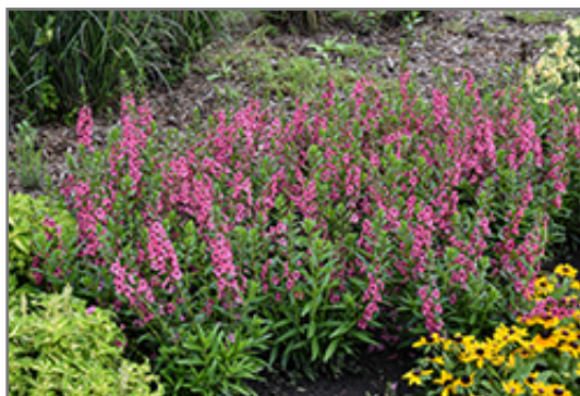
Angelface Perfectly Pink Angelonia in bloom