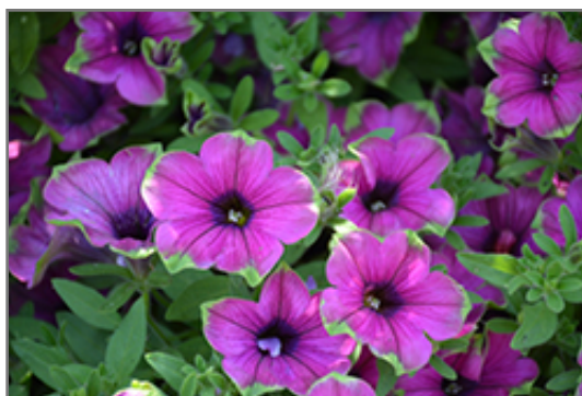
Supertunia Picasso In Purple Petunia flowers

Supertunia Picasso In Purple Petunia is recommended for the following landscape applications;