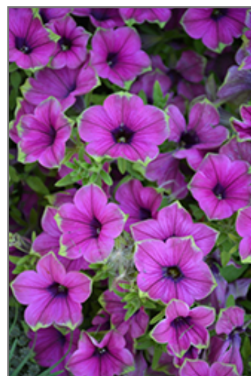
Supertunia Picasso In Purple Petunia flowers