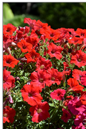
Supertunia Really Red Petunia flowers

Supertunia Really Red Petunia is recommended for the following landscape applications;