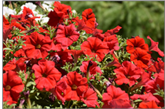
Supertunia Really Red Petunia flowers

Supertunia Really Red Petunia will grow to be about 8 inches tall at maturity, with a spread of 12 inches. When grown in masses or used as a bedding plant, individual plants should be spaced approximately 8 inches apart. Its foliage tends to remain low and dense right to the ground. This fast-growing annual will normally live for one full growing season, needing replacement the following year.