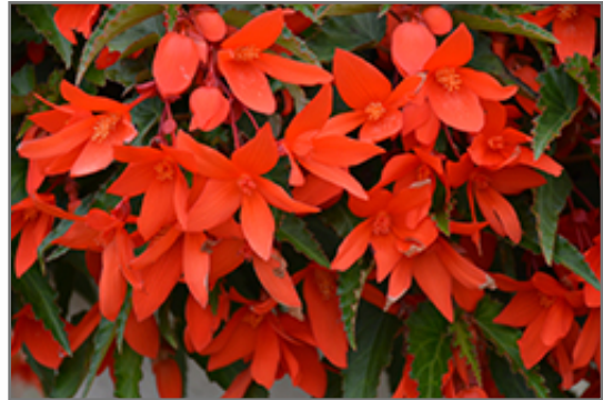
Waterfall Encanto Orange Begonia flowers