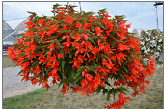
Waterfall Encanto Orange Begonia in bloom