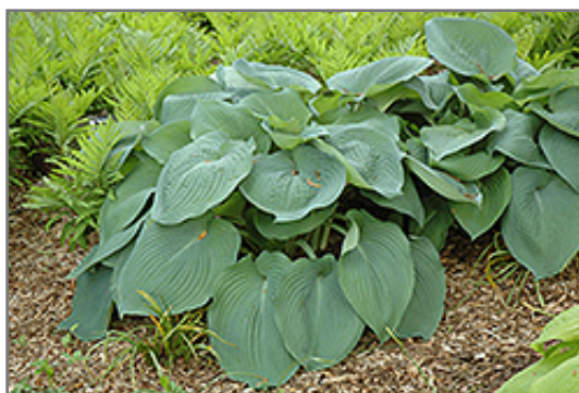
Blue Mammoth Hosta