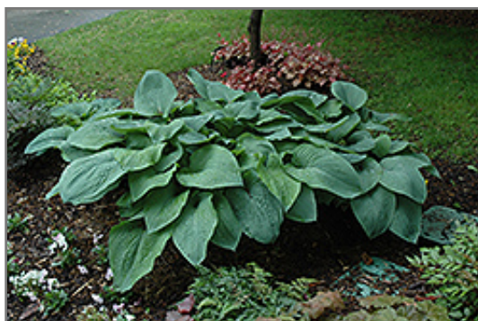
Blue Mammoth Hosta