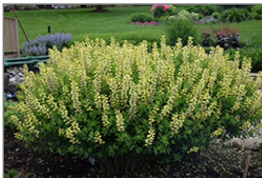
Decadence Lemon Meringue False Indigo in bloom