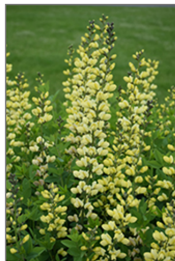
Decadence Lemon Meringue False Indigo flowers

This is a relatively low maintenance plant, and is best cleaned up in early spring before it resumes active growth for the season. It is a good choice for attracting bees and butterflies to your yard, but is not particularly attractive to deer who tend to leave it alone in favor of tastier treats. It has no significant negative characteristics.