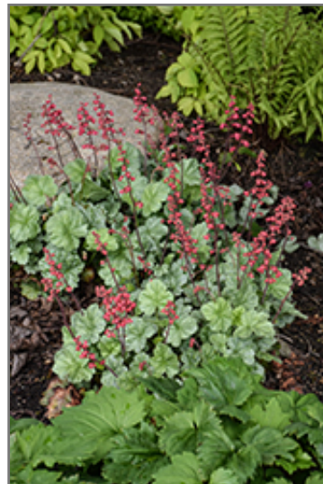
Dolce Spearmint Coral Bells in bloom