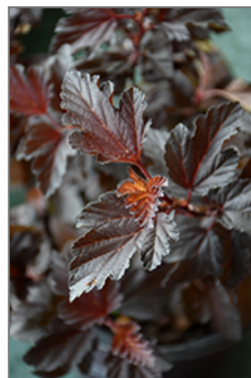
Fireside Ninebark flowers