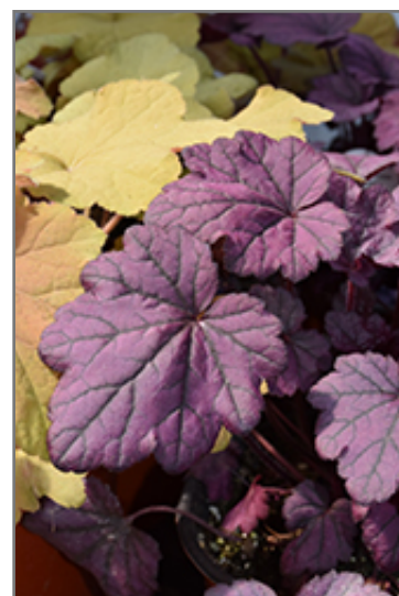
Electric Plum Coral Bells foliage