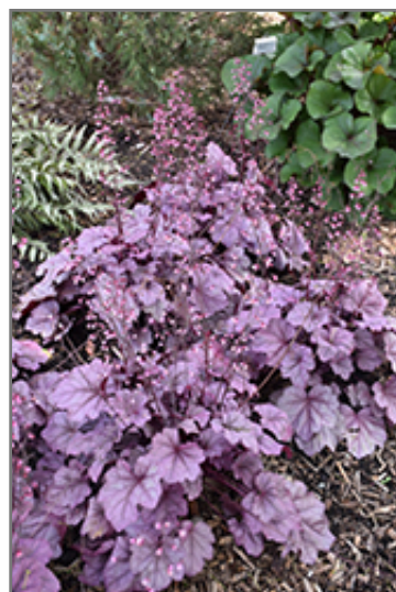
Pink Panther Coral Bells in bloom