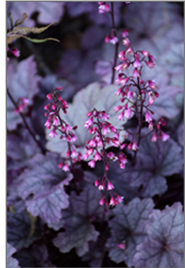
Pink Panther Coral Bells flowers

Pink Panther Coral Bells is a fine choice for the garden, but it is also a good selection for planting in outdoor pots and containers. With its upright habit of growth, it is best suited for use as a 'thriller' in the 'spiller-thriller-filler' container combination; plant it near the center of the pot, surrounded by smaller plants and those that spill over the edges. Note that when growing plants in outdoor containers and baskets, they may require more frequent waterings than they would in the yard or garden. Be aware that in our climate, most plants cannot be expected to survive the winter if left in containers outdoors, and this plant is no exception. Contact our experts for more information on how to protect it over the winter months.