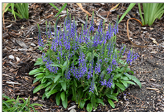
Magic Show Wizard of Ahhs Speedwell in bloom

Magic Show Wizard of Ahhs Speedwell is recommended for the following landscape applications;