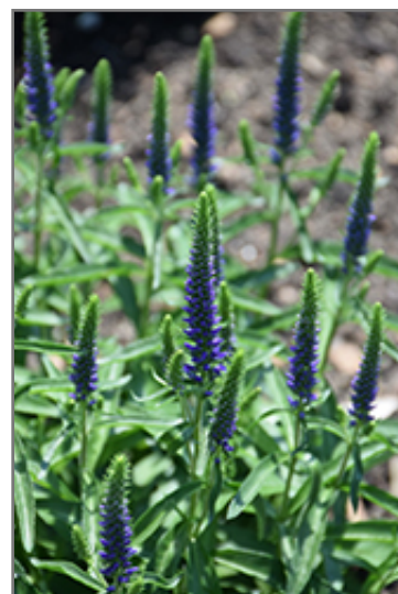
Magic Show Wizard of Ahhs Speedwell flowers

Magic Show Wizard of Ahhs Speedwell will grow to be about 12 inches tall at maturity extending to 16 inches tall with the flowers, with a spread of 22 inches. When grown in masses or used as a bedding plant, individual plants should be spaced approximately 18 inches apart. Its foliage tends to remain dense right to the ground, not requiring facer plants in front. It grows at a medium rate, and under ideal conditions can be expected to live for approximately 8 years. As an herbaceous perennial, this plant will usually die back to the crown each winter, and will regrow from the base each spring. Be careful not to disturb the crown in late winter when it may not be readily seen!