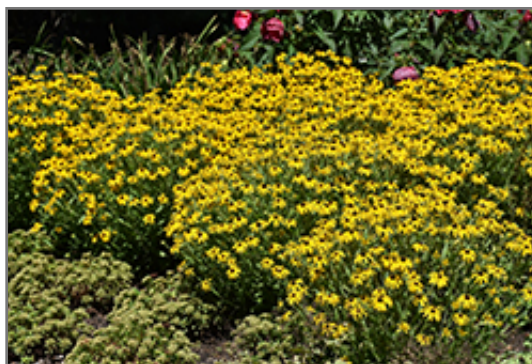
American Gold Rush Coneflower in bloom