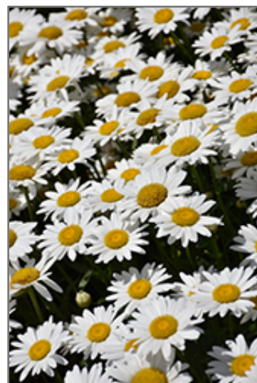
Becky Shasta Daisy flowers