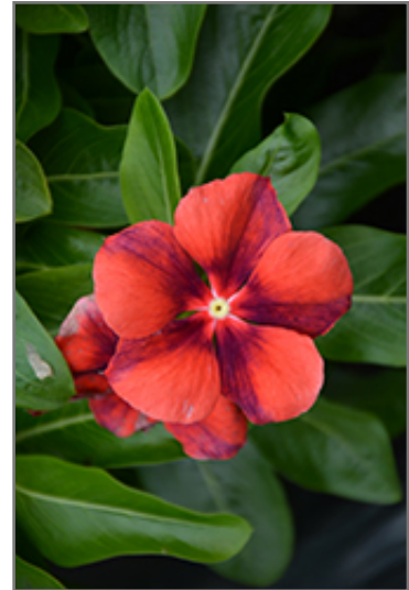
Tattoo Tangerine Vinca flowers

Tattoo Tangerine Vinca is recommended for the following landscape applications;