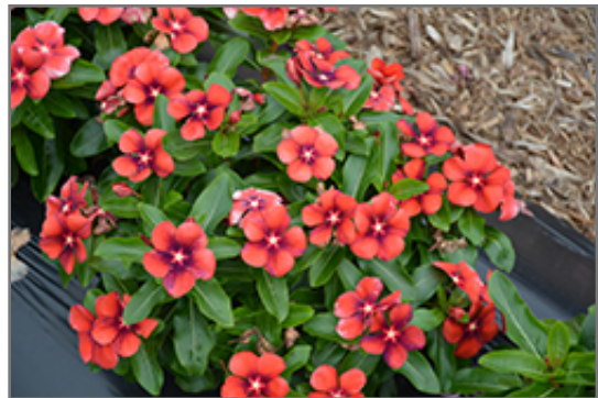
Tattoo Tangerine Vinca in bloom