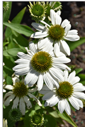
Kismet White Coneflower flowers