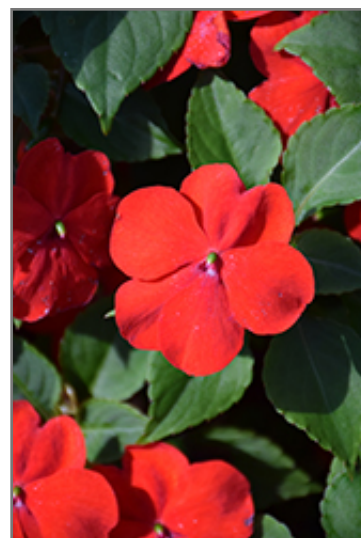
Beacon Bright Red Impatiens flowers