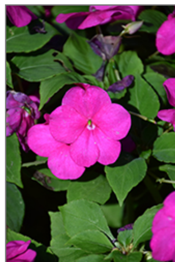
Beacon Violet Shades Impatiens flowers