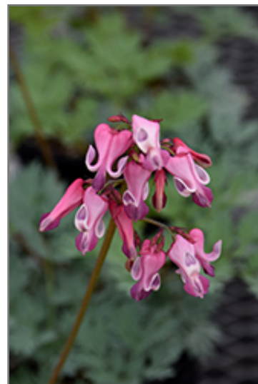
Pink Diamonds Fern-leaved Bleeding Heart flowers

Pink Diamonds Fern-leaved Bleeding Heart is a fine choice for the garden, but it is also a good selection for planting in outdoor pots and containers. It is often used as a 'filler' in the 'spiller-thriller-filler' container combination, providing a mass of flowers and foliage against which the thriller plants stand out. Note that when growing plants in outdoor containers and baskets, they may require more frequent waterings than they would in the yard or garden. Be aware that in our climate, most plants cannot be expected to survive the winter if left in containers outdoors, and this plant is no exception. Contact our experts for more information on how to protect it over the winter months.