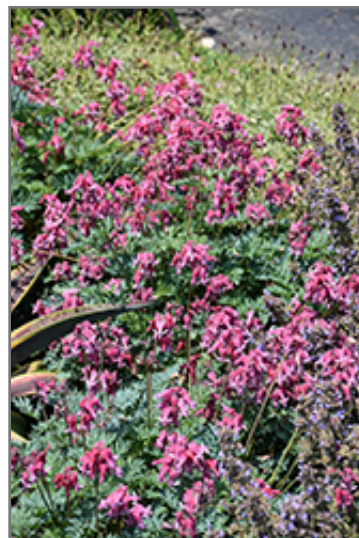
Pink Diamonds Fern-leaved Bleeding Heart flowers

This plant will require occasional maintenance and upkeep, and should be cut back in late fall in preparation for winter. It is a good choice for attracting butterflies to your yard, but is not particularly attractive to deer who tend to leave it alone in favor of tastier treats. It has no significant negative characteristics.